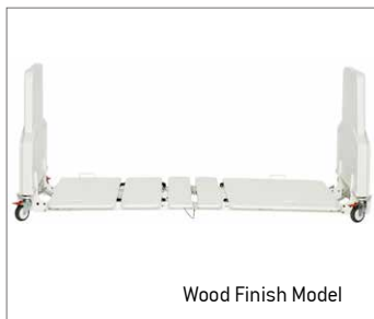
Wood Finish Model