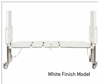
White Finish Model