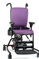
Large hi/lo base R870 Rifton Activity Chair