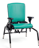
Large standard base R860 Rifton Activity Chair